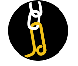
Shackle / Pendant